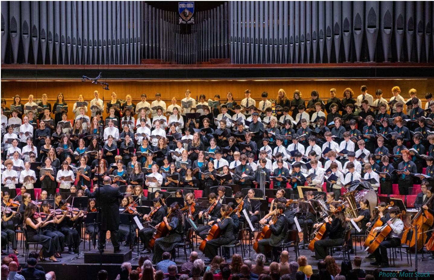
CSHS, MLC and Hale choristers join the UWA Conservatorium to perform Karl Jenkins' The Armed Man - A Mass for Peace